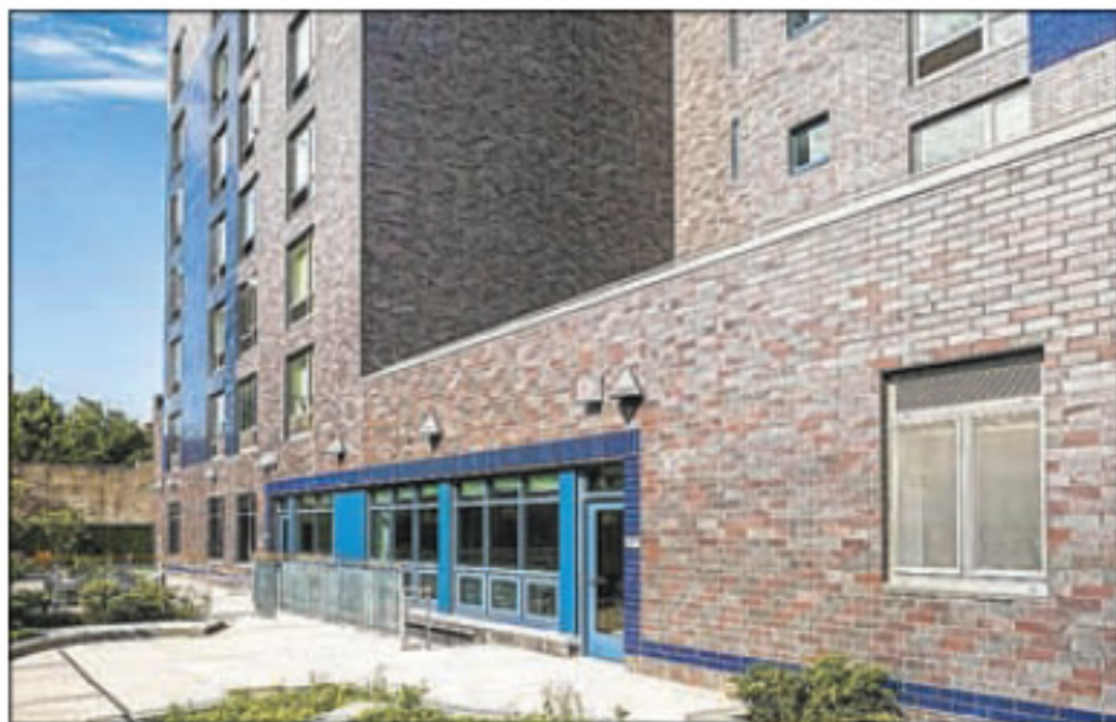
Wales Avenue Residence features a landscaped rear yard offering a relaxing environment for resident groups as well as raised planting beds to accommodate community gardening.